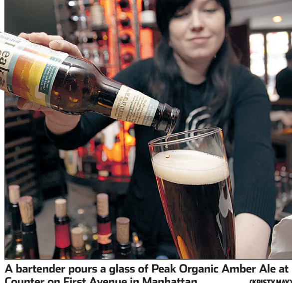
Counter on First Avenue in Manhattan.

105 First Ave., btwn Sixth and Seventh sts., 212-982-5870 Counter is an organic wine and martini bar and