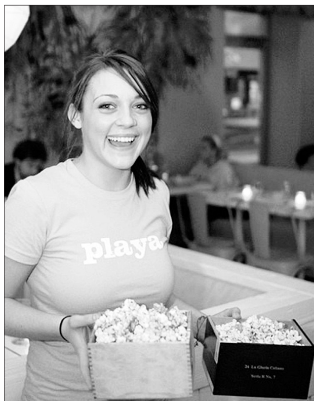
Park Slope's Cabana Bar has a Latin-American resort feel, and serves drinks and a full menu.

The owners of this bar and its neighboring restaurant, Playa , want President Street and Fifth Avenue to be transformed into a